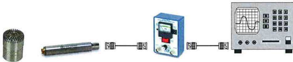
Prepolarized Microphone System