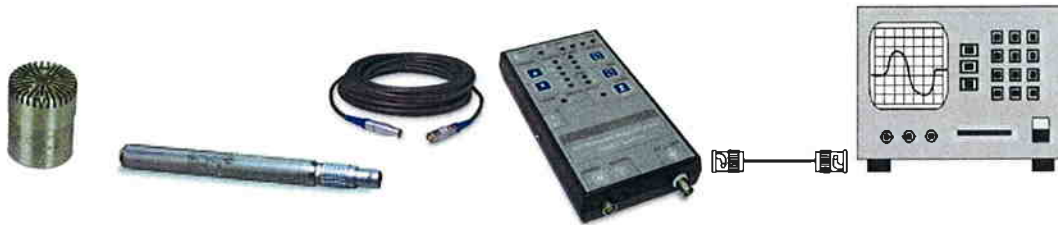
Externally Polarized Microphone System

A prepolarized microphone can be used with a standard Microphone Power Supply that is designed for externally powered microphones, and its preamplifier, provided that you set the supply voltage to zero.