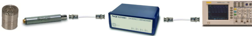
Prepolarized Microphone System