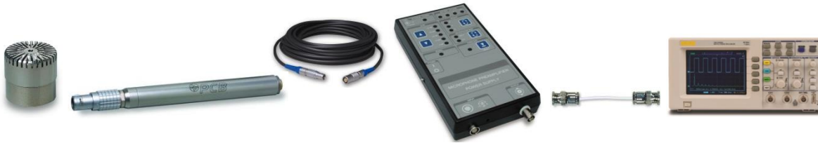
Externally Polarized Microphone System